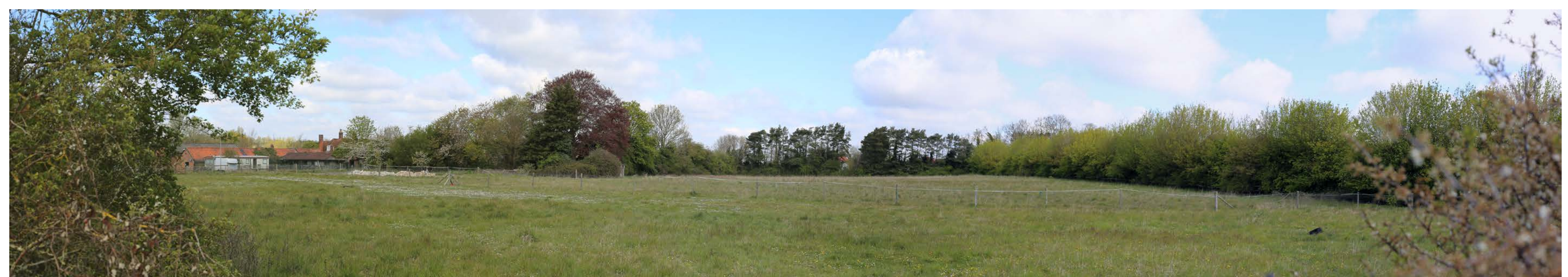
Views of the site